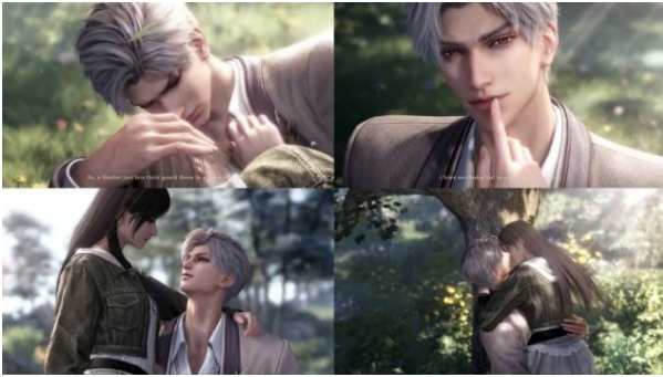
Figure 2. Sylus Birthday Card Event

An example of a feature that is favored by players is the reminder feature. This feature can remind players to eat, do tasks, and even serve as a reminder of the menstrual cycle. In addition to being a period tracker, the remind me feature can be personalized such as daily to do, or special events such as birthdays. The reminder feature is very liked by players because players feel that they are being noticed by the love interest character. Players feel that the love interest character is very romantic because they remember the little things of the player. Even if the player uses this feature as a reminder of the menstrual cycle, the love interest character can respond as if they care about the player's health during menstruation. Love interest characters often provide affection when players are experiencing menstruation and provide support to players if players use this feature as a reminder to learn and remind players to get enough rest.