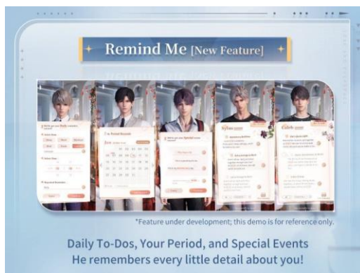
Figure 3. Remind Me Feature

With this personalization, AI can provide more emotionally deep and relevant responses to users. This interaction creates feedback where self-disclosure is carried out by the user and clarifies the user's mental picture and representation (Bianca, 2024).