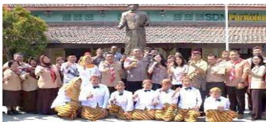
Figure 4. Inauguration of temporary museum gubug wayang Soekarno School Purwotengah