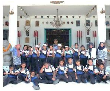
Figure 5. Macapat Routine Activity

Gubug Wayang Museum not only focuses on historical education, but is also active in preserving Javanese arts and culture through various creative and interactive programs. One of its flagship activities is the Macapat Group and Wayang Road Show . With these activities, it is hoped that participants will not only enjoy modern art, but also understand local wisdom and values culture passed down by the ancestors.