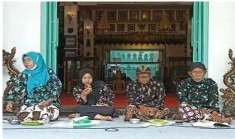
Figure 3. Pacet Twin Sources Educational Tour

Source: Documentation of Gubug Wayang Museum, October 2024