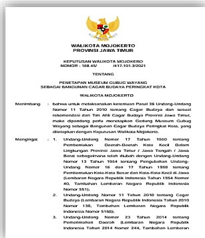
Figure 1. Decree of the Mayor Decree on the Cultural Heritage of Gubug Wayang Museum

As a regulator, the government has the authority to set policies, regulations, and supervision of museum management in accordance with applicable regulations. One of the concrete steps that has been taken by the Mojokerto City Government through the Mojokerto City Youth, Sports and Tourism Office (Disporapar) is to issue a Decree (SK) Mayor Regulation No. 188.45/417.101.3/2021 concerning the Determination of the Gubug Wayang Museum as a City- Ranked Cultural Heritage Building. With this regulation, Gubug Wayang Museum is officially recognized as a cultural asset that must be protected and developed for the benefit of education, historical preservation, and regional tourism. The government is also responsible for ensuring the museum is managed in accordance with established standards, including in the aspects of collection maintenance, facility improvement, and promotion to the wider community (Yuniningsih et al. 2023).