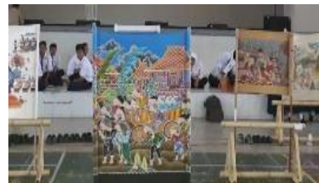
Figure 6. Mojokerto City Puppet And Art Festival Source: Documentation of Gubug Wayang Museum, October 2024

Source: Documentation of Gubug Wayang Museum, October 2024